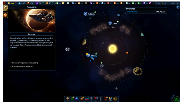
New Quest Events

For more information on the Galactic Civilizations IV: Megastructures Expansion, check out www.galciv4.com/megastructures .